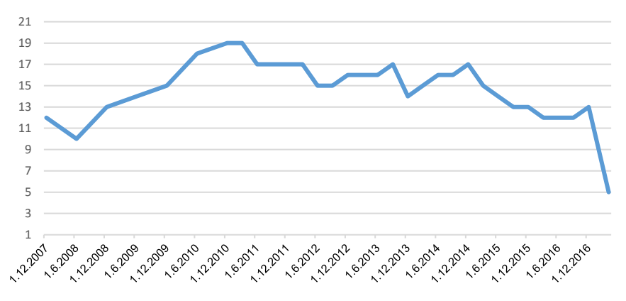
Figure 1. Number of factoring companies in Croatia

In the Republic of Croatia, the number of factoring companies varies widely, as can be seen from the line chart.